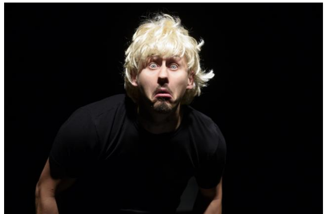
Photo: Kolomaž Theater: Blázon [The Madman], 2014, Radovan Stoklasa