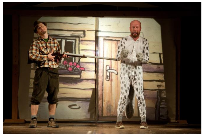
Photo: Kolomaž Theater: Little Red Riding Hood, 2012, Radovan Stoklasa