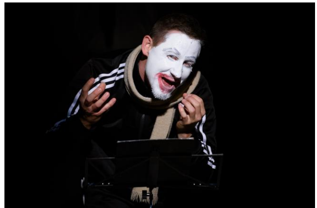
Photo: Kolomaž Theater: Komunál [The Municipality], 2014, Radovan Stoklasa