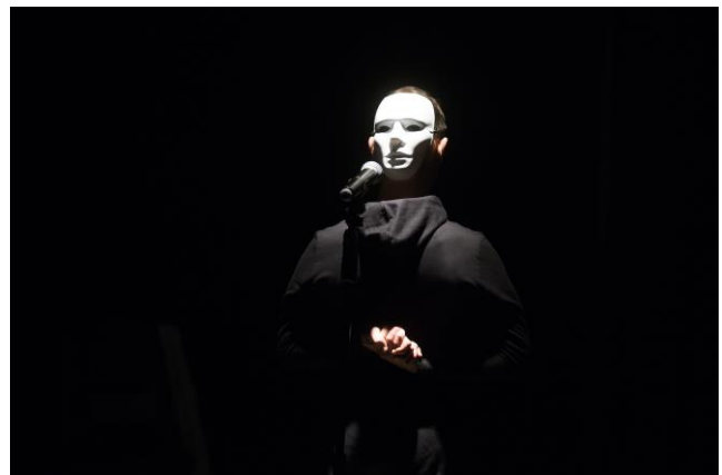
Photo: Kolomaž Theater: Europeana – a brief history of the 20th century, 2016, Radovan Stoklasa